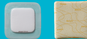
Biatain® Silicone Biatain® Non-Adhesive