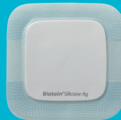
Biatain® Silicone Ag