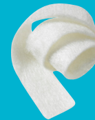
Biatain® Alginate Ag