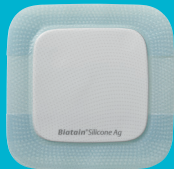
Biatain® Silicone Ag