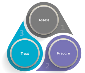
The Coloplast 3 Step Approach