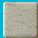
Biatain® Ag Non-Adhesive