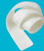
Biatain® Alginate Ag