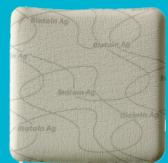
Biatain® Ag Non-Adhesive